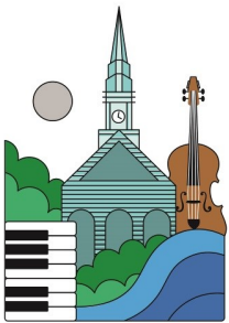
Mystic Chamber Music Series

Very early in the morning, on the first day of the week, they came to the tomb when the sun had risen. -Mark 16:2