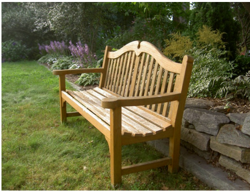
Place for quiet reflection

Further information may be obtained by calling the Noank Baptist Church (860-536-7129) or by writing to the Memorial Garden Ministry Team.