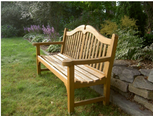
Place for quiet reflection

Further information may be obtained by calling the Noank Baptist Church (860-536-7129) or by writing to the Memorial Garden Ministry Team.