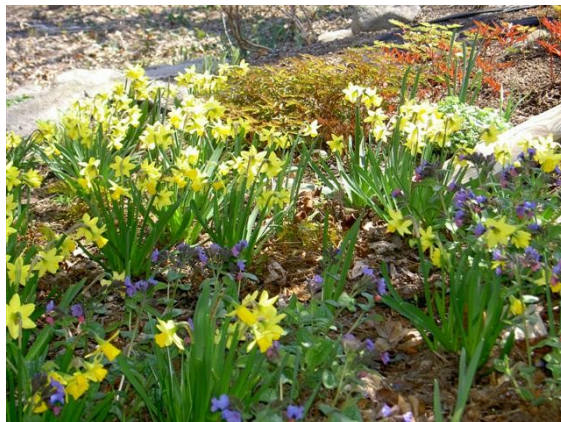
Glimpse of memorial gardens in springtime