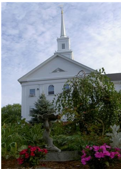
View of Noank Baptist Church from Memorial Garden

Memorial Garden gifts are welcome. Such gifts will be added to the garden's Endowment Fund providing for the long-term care and maintenance of the garden.